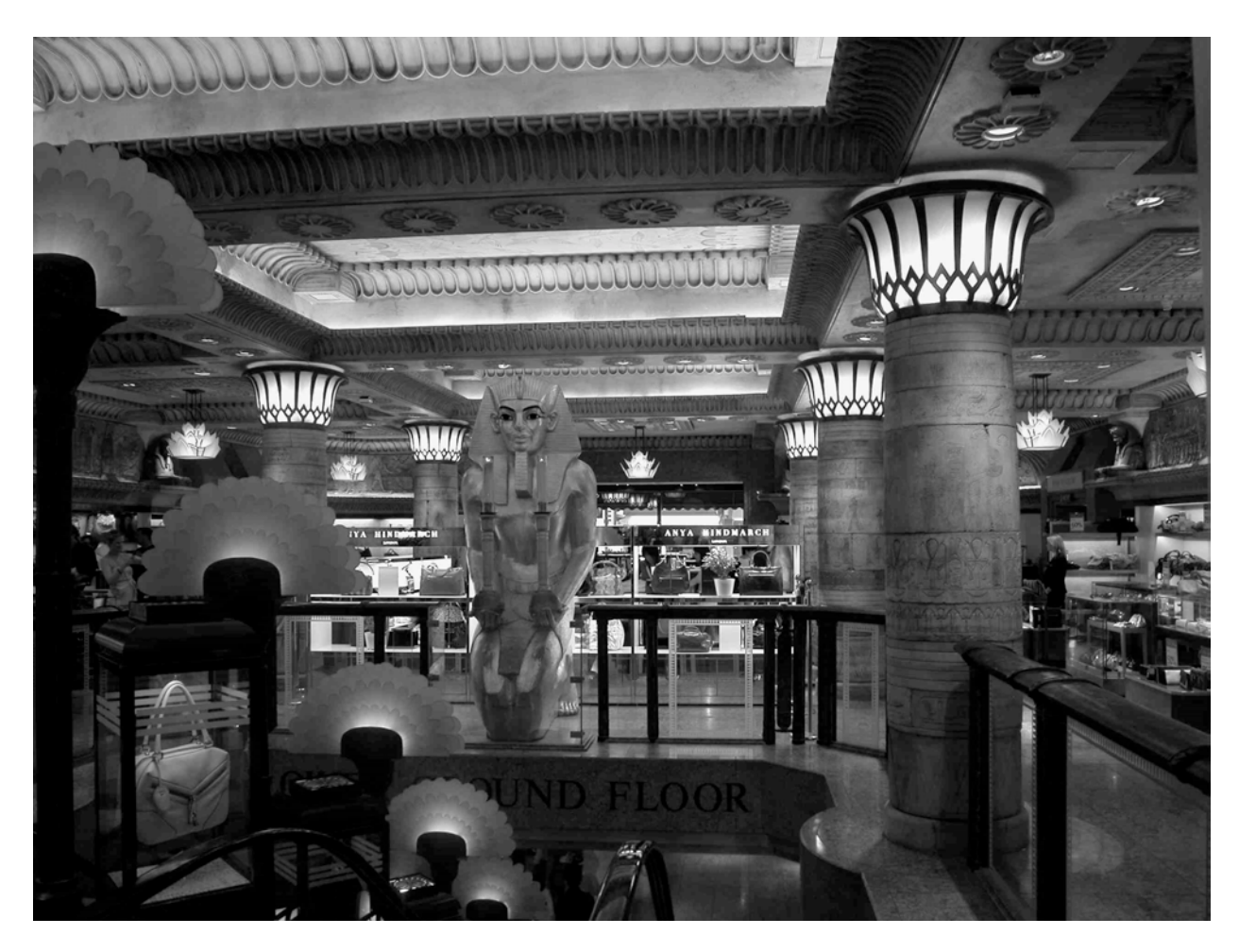
Figure 1 While Egyptian motifs and replica antiquities are found throughout Harrods department store in London, they are showcased in the opulent Egyptian Room, designed for Mohammed Al Fayed, then owner of Harrods. The question of appropriation is complicated by the fact that Al Fayed is Egyptian by birth.