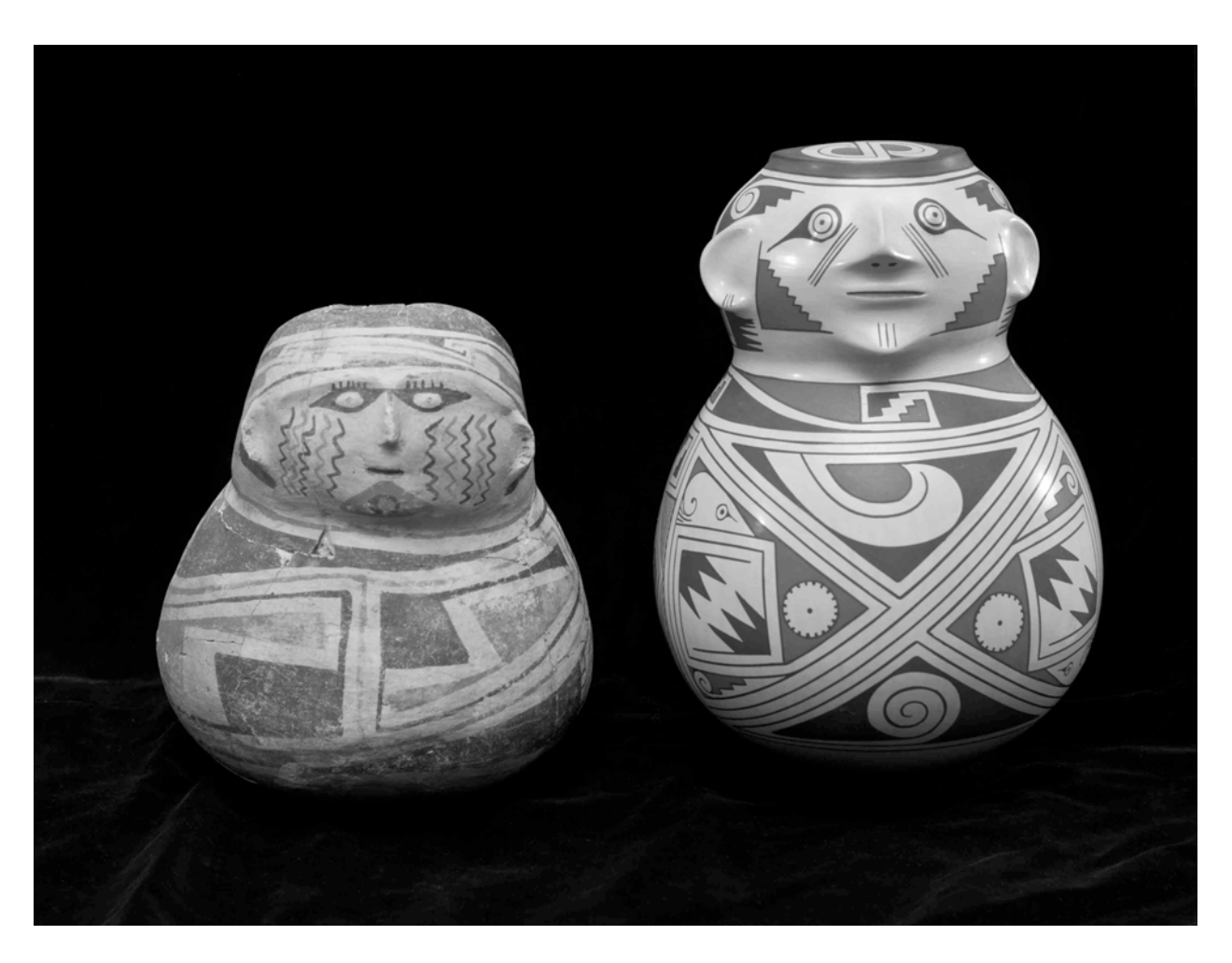
Figure 2 Inspired by ancient ceramics from Casas Grandes, Mata Ortiz pottery developed through the efforts of a single individual in the 1970s and subsequently become a community-wide "revival" that blends old and new forms. LEFT: 14th century hooded effigy jar from Casas Grandes compared with RIGHT: contemporary hooded effigy jar from Mata Ortiz. Private Collection.