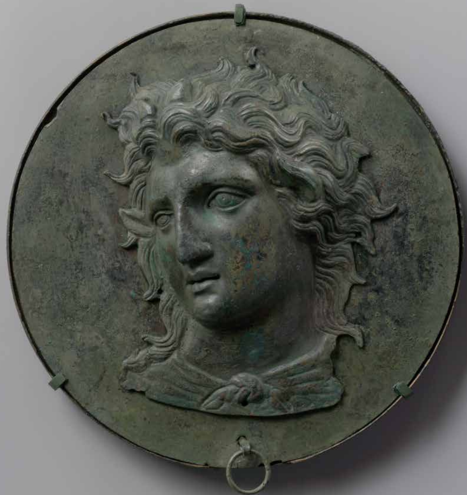
Bronze box mirror with relief of goat-god Pan (late 7th century BCE), Metropolitan Museum of Art, New York