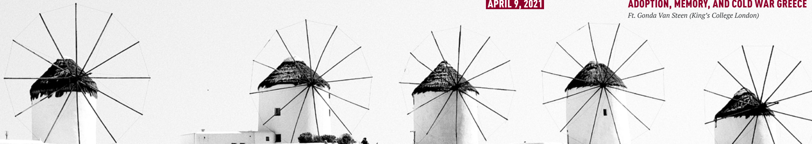
Windmills of Mykonos