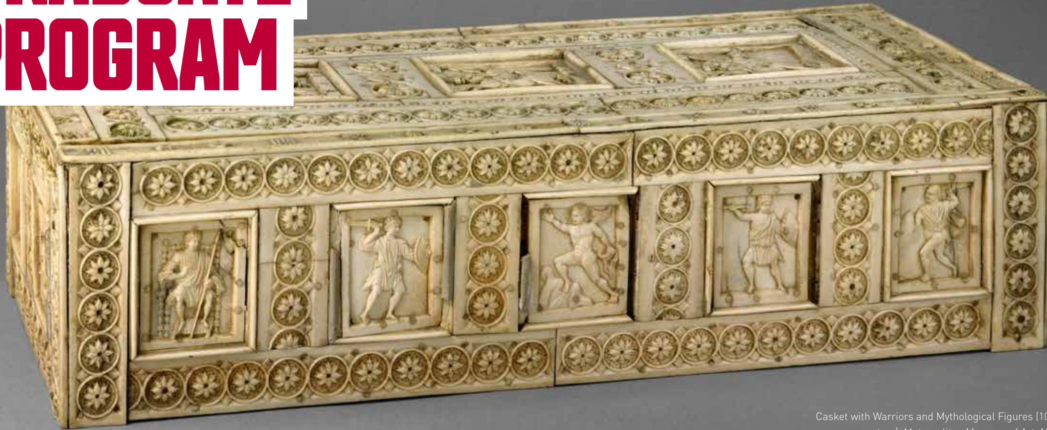
Casket with Warriors and Mythological Figures (10th-11th century), Metropolitan Museum of Art New York