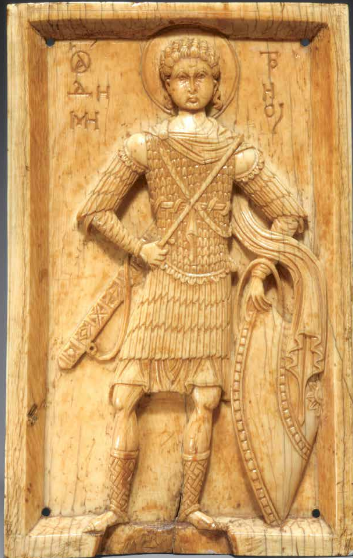
Icon with Saint Demetrios (950–1000 CE), Metropolitan Museum of Art, New York