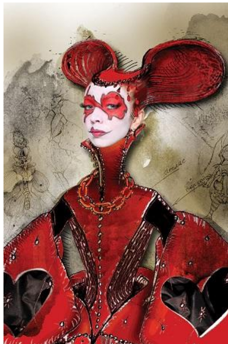
by Ice Vision

Your goal is to maintain the consistency of your beliefs as you add new beliefs. This chapter is devoted to exploring how to achieve this goal. All of us want to remove any inconsistent beliefs we have, because if we don't then we are accepting something impossible. We aren't like the red queen in Alice in Wonderland who said she could believe six impossible things before breakfast.