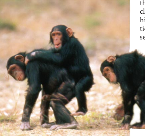
Figure 2 The common ancestor of modern humans and African apes, including gorillas, bonobos and chimps (pictured), may have used a form of locomotion called 'knuckle-walking' when on the ground.

of fossil morphology in terms of function, especially locomotion. Ever since Lucy was discovered in the late 1970s, there has been debate about the locomotor repertoire of A. afarensis, the species to which she is assigned.