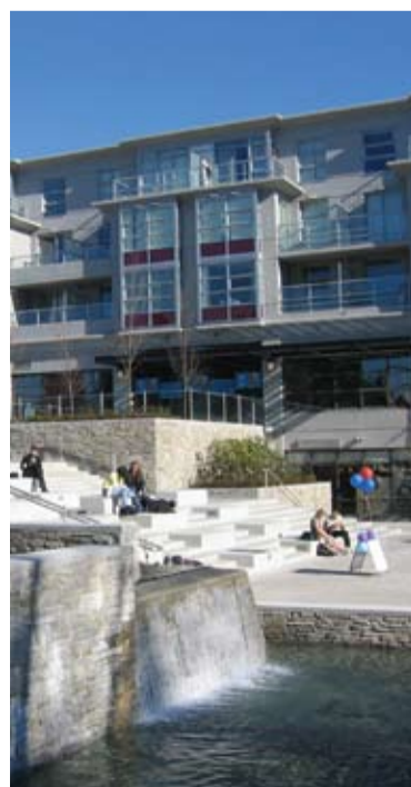
UniverCity's Town Square

More than 15,000 people attended Open House 2006, and since then SFU has continued to grow.