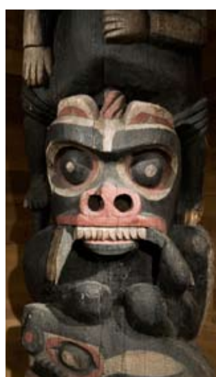
Totem pole detail, SFU's Museum of Archaeology and Ethnology