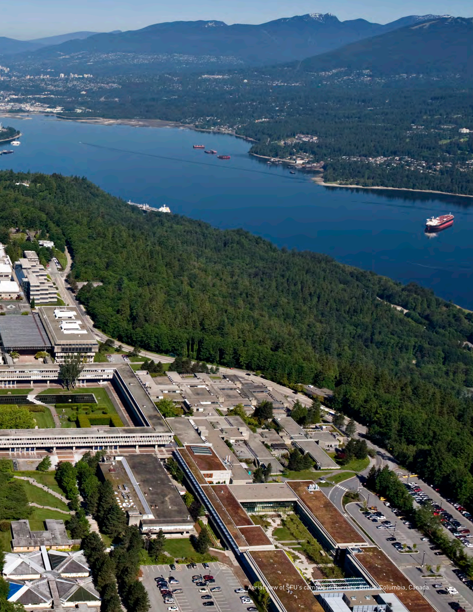
Aerial view of SFU's campus in Burnaby, British Columbia, Canada.